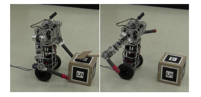
Fig. 1. The uBot-6 mobile manipulator performing a "what's up?" gesture to convey that it is surprised after an unexpected event.

In [24], environment, sensors, robots, models, and computation are considered as the five factors that give rise to uncertainty in robotic applications. Instead of categorizing uncertainty based on the cause, we focus on how it is perceived. Uncertainties a robot may encounter are classified into two categories: 1) random transitions that are within the model domain but may still be unlikely given transition probabilities, and, 2) "surprise" transitions that lead to outcomes that are not represented in the model domain. An example of a random transition is the outcome of rolling a loaded die that should come up 6 with high probability, but instead comes up 1. The robot will not be able to predict the exact outcome, but by having a model that captures low probability outcomes it is capable of handling each of them accordingly. An example of a surprise transition is if the outcome of rolling a 6 sided die is 13 while the robot's die model has possible outcomes from 1 to 6. In [3], Casti describes that "surprise can arise only as a consequence of models that are unfaithful to nature." Therefore we define a "surprise" transition as when the robot observations are not